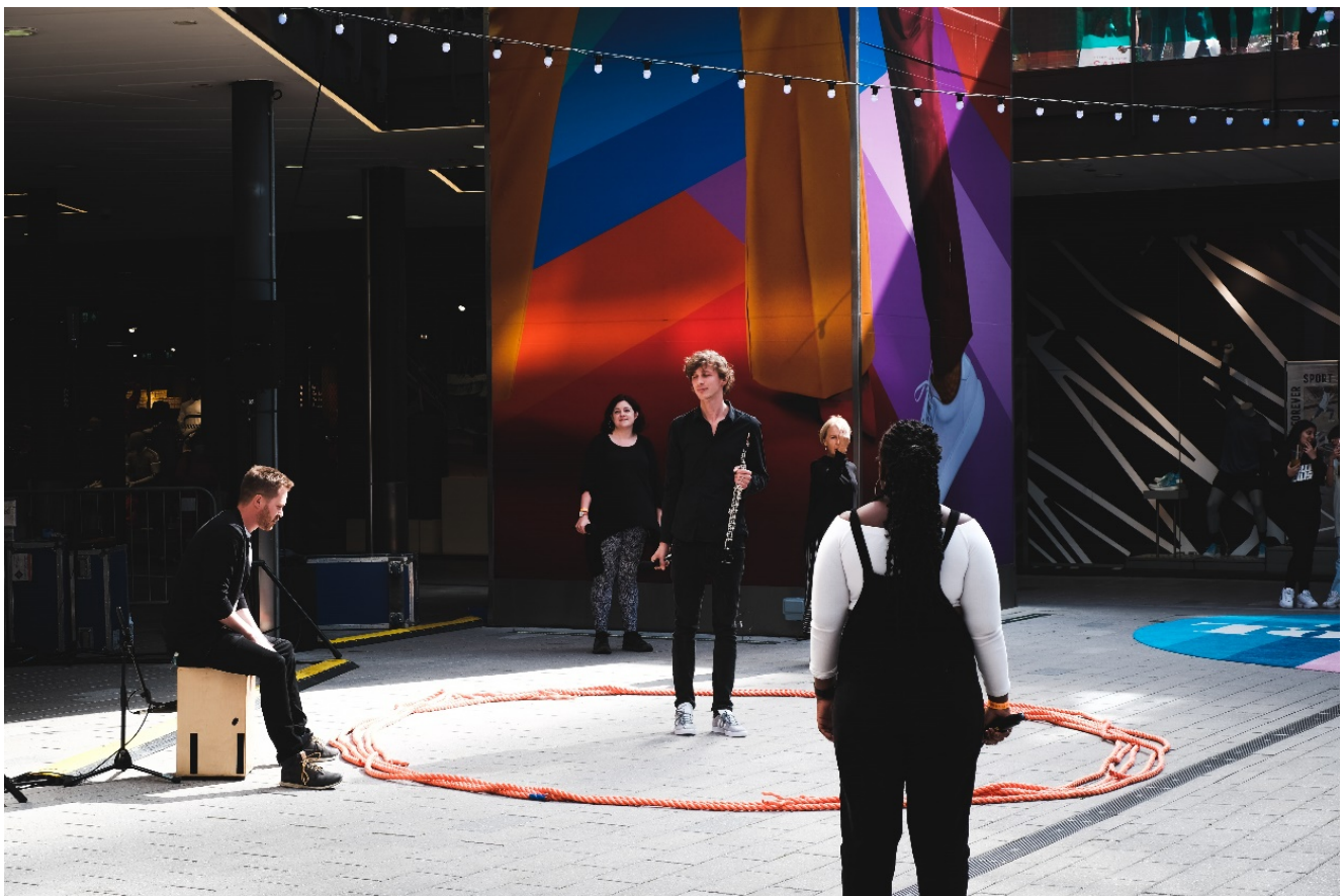
RPO musicians perform with spoken word poetry group WordUp in Wembley Park for Wemba's Dream, Sep 2021

Thank you for your interest in the Royal Philharmonic Orchestra. We really hope we have inspired you to want to develop your career with us, and to helping us towards a vibrant future.