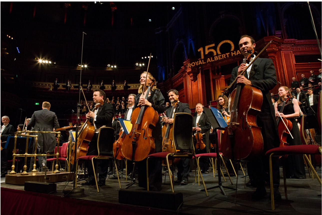
The RPO at its 75th anniversary gala concert at the Royal Albert Hall, Sep 2021

About RPO Resound: https://www.rpo.co.uk/rpo-resound/in-action