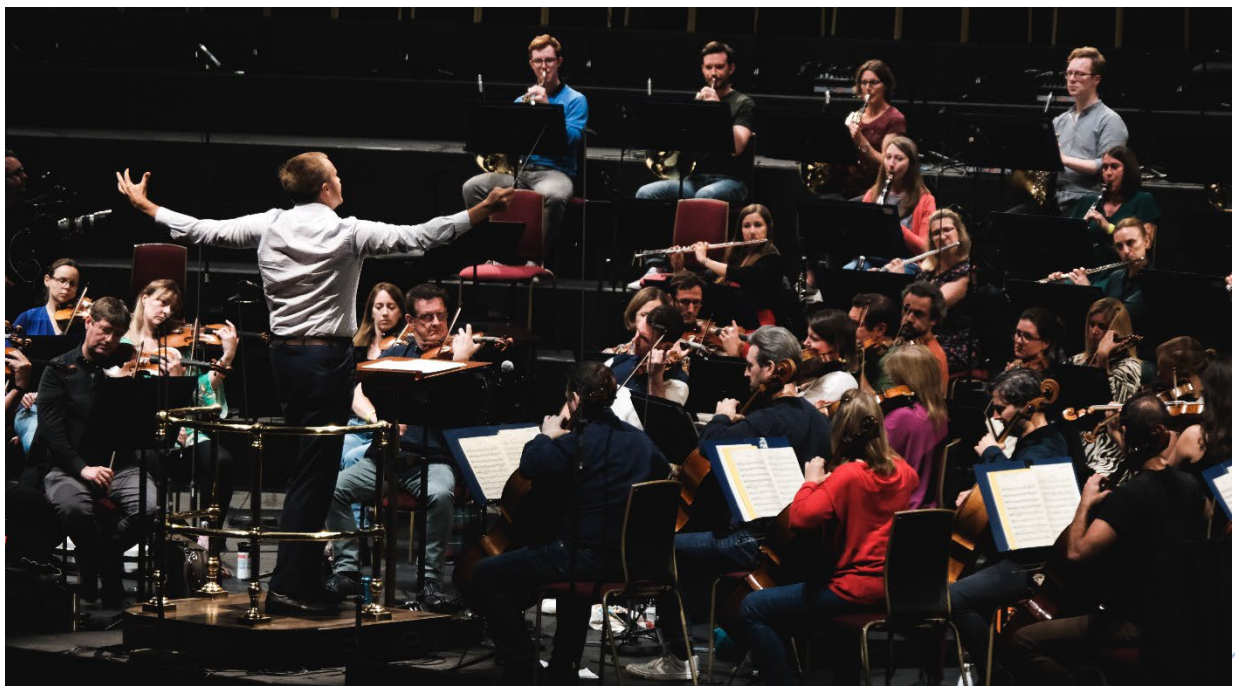
Vasily Petrenko rehearses the Orchestra for the RPO's 75th anniversary at the Royal Albert Hall, Sep 2021

Read our Inclusion and Diversity Policy: https://www.rpo.co.uk/inclusion-and-diversity-policy