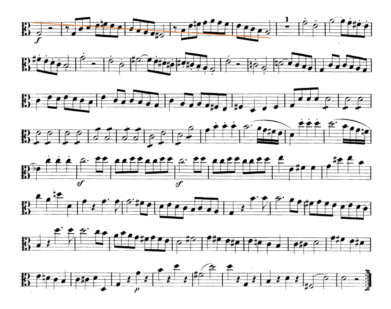
BRAHMS Symphony No2 2nd Mov Bar 49-55

MOZART - Symphony No 41 4th Movement Bar 100-157