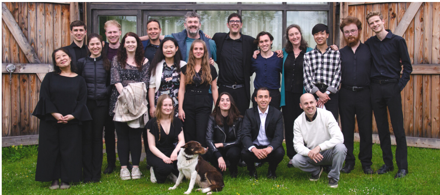
Class of 2021