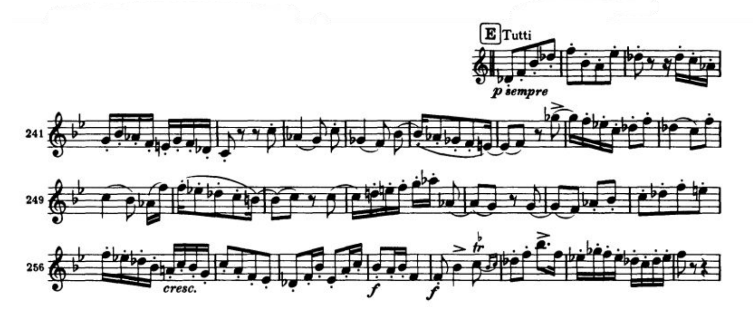
III. [E] to measure 263