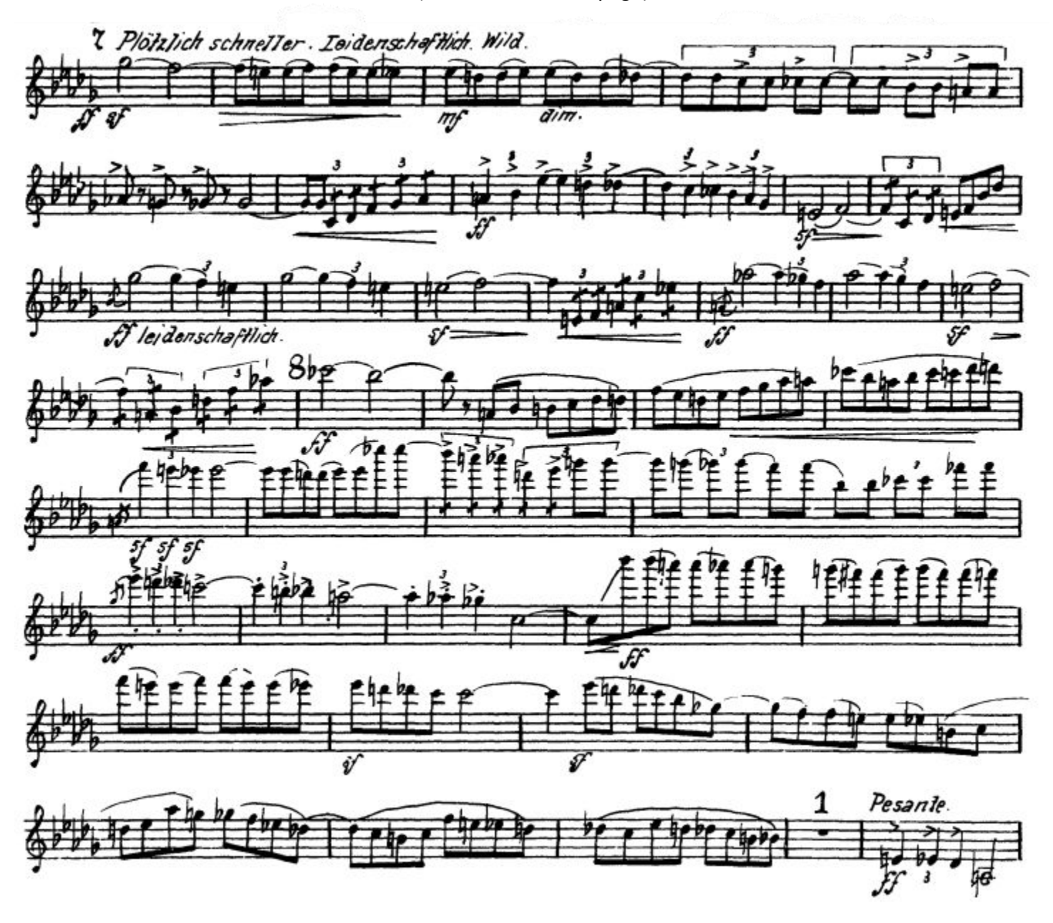
page 1 of 2 (continued on next page)

I. [7] through downbeat of 8 before [11]