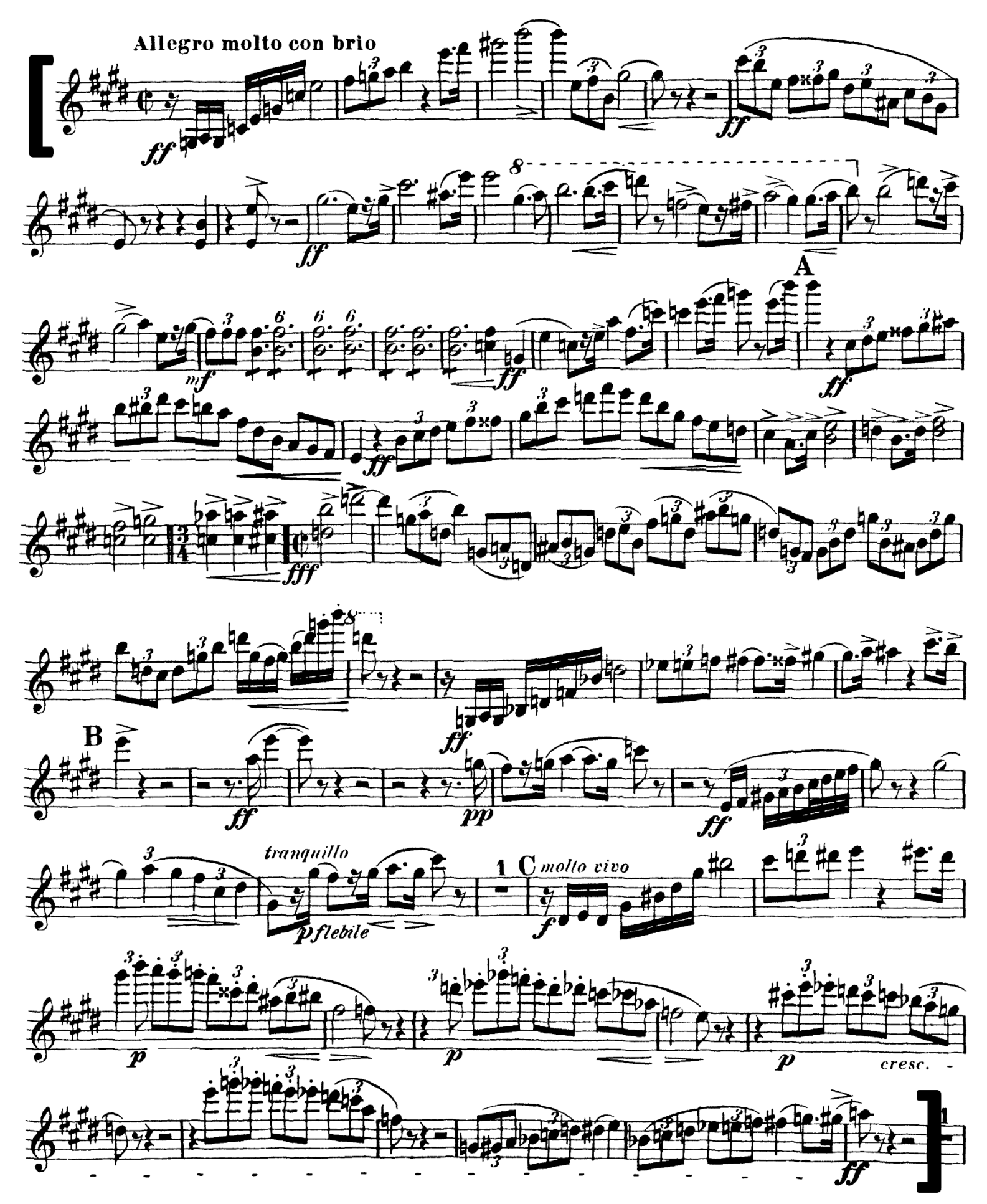
Excerpt 1 Allegro molto con brio

From Beginning until 13 bars after C - as marked